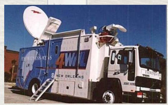
Satellite News Trucks pictured above were deployed following Hurricane Katrina.

DIRECTV provides satellite subscribers access to national news, weather and (to the extent they are unaffected) their local broadcast channels during a natural disaster and has also activated temporary channels during a disaster event.