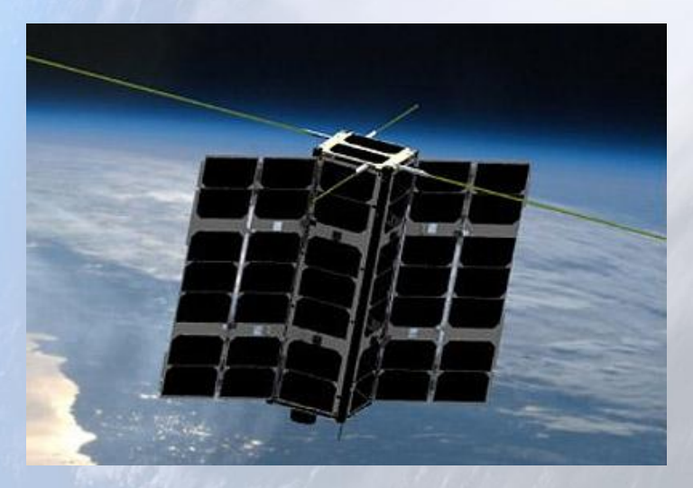
Spire Global satellites provide commercial and government customers with radio occultation data for atmospheric temperature, pressure and humidity that can be vital for forecasting severe weather.