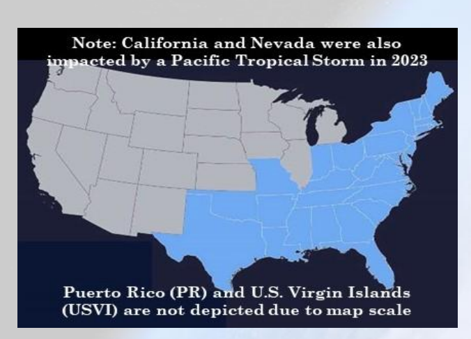
(Above) Since Hurricane Katrina, 28 U.S. States plus 2 U.S. Territories and millions of Americans have been severely impacted by Atlantic hurricanes and tropical cyclones.

Due to Recent Leaps in Innovation, Satellites are Providing More Data to Forecasters, Emergency Planners and Responders than Ever Before. Satellites are Playing an Increasingly Critical Role in Saving Lives and Providing Services Before, During and After Weather Related Disasters Such as Hurricanes or Wildfires