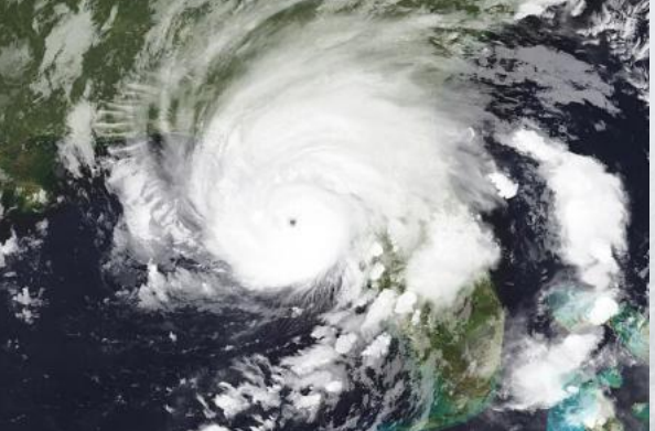
(left) GOES-R series satellites provide life-saving images to forecasters and emergency officials like this image (right) taken of Hurricane Idalia in August, 2023. The newest satellite GOES-U, built by Lockheed Martin, was successfully launched on June 25, 2024. This final next-gen R-series weather satellite will be renamed GOES-19 once it reaches GEO orbit over the western hemisphere.